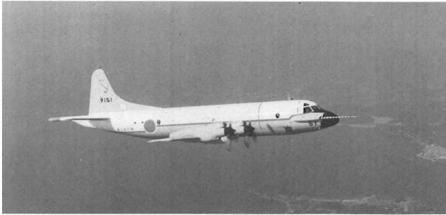
This JMSDF UP-3C is an airborne systems flying testbed. The aircraft will be operated by VX-51 Air Development Squadron.

The prototype system has undergone operational testing in a major Australian air defense exercise. The next phase of the program has now proceeded, with the first nine production MOD aircraft completed and undergoing operational testing.