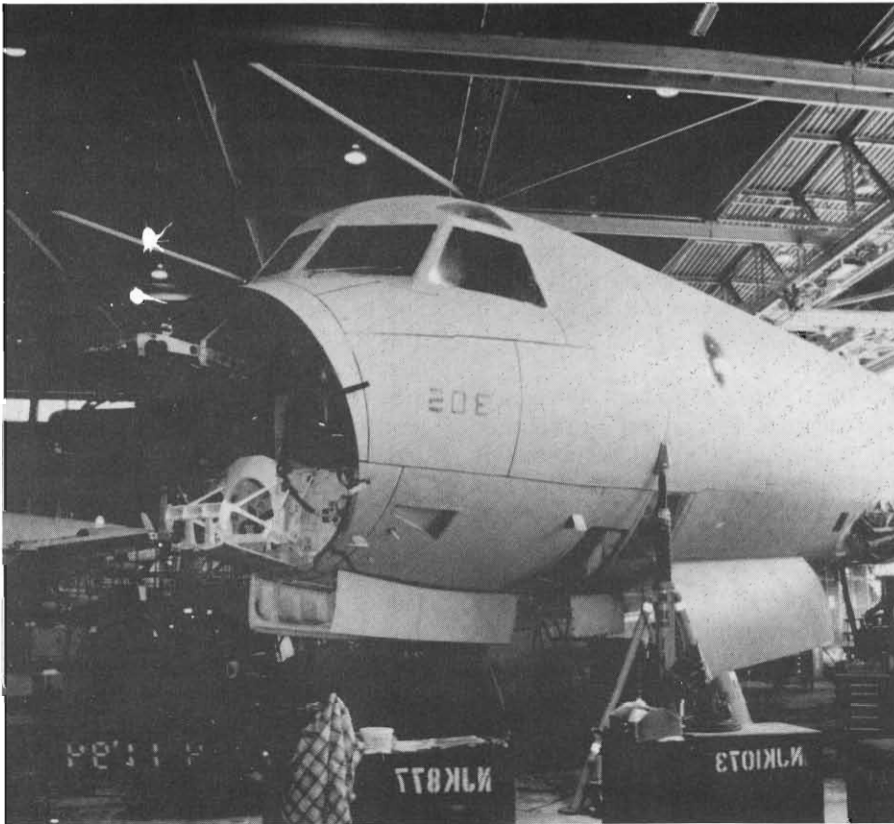
First Thailand P-3T (152142) on NADEP Jacksonville Mod line.

engines, and six-bladed Dowty high-tech composite props for lower engine-operating costs, increased fuel efficiency, and greater reliability and maintainability. The program also features a modernized flight station with a full Glass Cockpit, electronic controls and heads up-displays. This is a two-man cockpit, with Mil-Std DataBus Architecture.