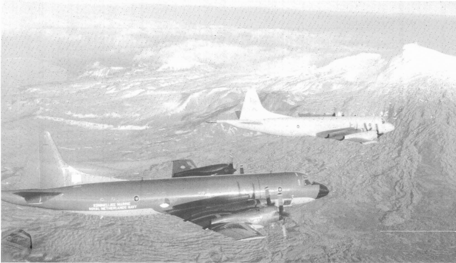
Netherlands and USN P3s are seen in formation over the coast of Iceland.